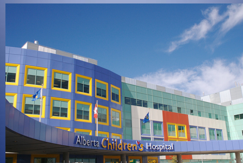
Alberta Children Hospital Head shape clinic